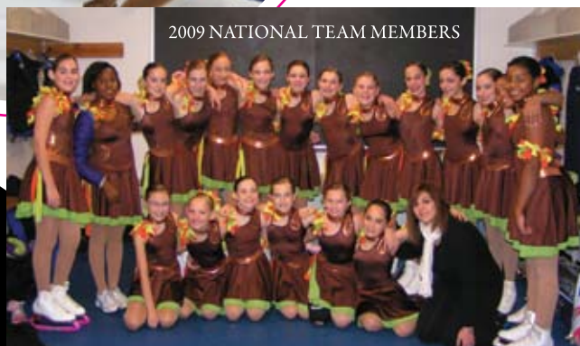
2009 NATIONAL TEAM MEMBERS

"Skating on the Juvenile team has been a great leap for me! It challenges me to do my best for the team."