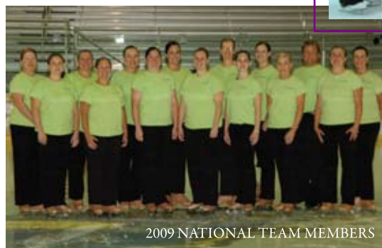
2009 NATIONAL TEAM MEMBERS

A team or 12-20 skaters. All skaters must be 25 years or older, with the majority of the team 35 years or older. Our Masters team typically practices once a week and attends 4 competitions out of state and several local exhibitions.