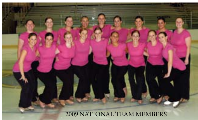
2009 NATIONAL TEAM MEMBERS

A team or 12-20 skaters. All skaters must be 21 years or older, with the majority of the team 25 years or older. All skaters must have passed at least one of the following tests: preliminary moves in the field, adult bronze moves in the field, preliminary figure or preliminary dance. Our Adult team typically practices once a week and attends 4 competitions out of state and several local exhibitions.