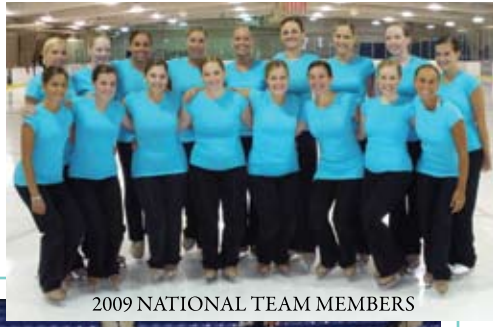
2009 NATIONAL TEAM MEMBERS

A team of 16 skaters. Skaters must be at least 14 years old and have passed the novice moves in the field test. Our Senior team typically practices twice a week and attends 5-6 competitions out of state and several local exhibitions.