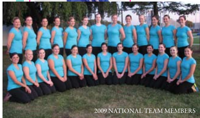
2009 NATIONAL TEAM MEMBERS

A team of 12-20 skaters. Skaters must be enrolled in a college or degree program as full-time University of Delaware students and have passed the intermediate moves in the field test or higher. Our Collegiate team typically practices twice a week and attends 5-6 competitions out of state and several local exhibitions. All skaters must be full time students of the University of Delaware.